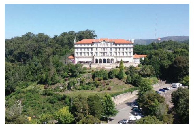
VIANA do CASTELO Thurs 25th Pousada de Viana do Castelo