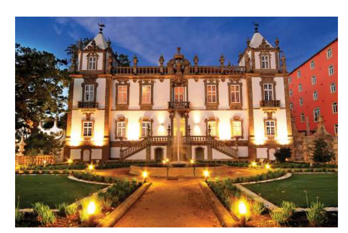
PORTO Tue 23rd & Wed 24th May Pousada Palacio de Freixo