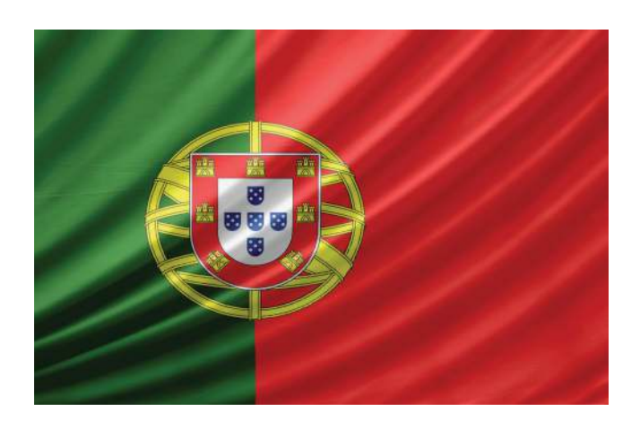
Jolly Good Tours Portugal 2017