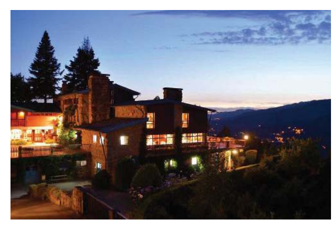
PENEDA - GERES Fri 26th & Sat 27th Pousada de Geres Canicada