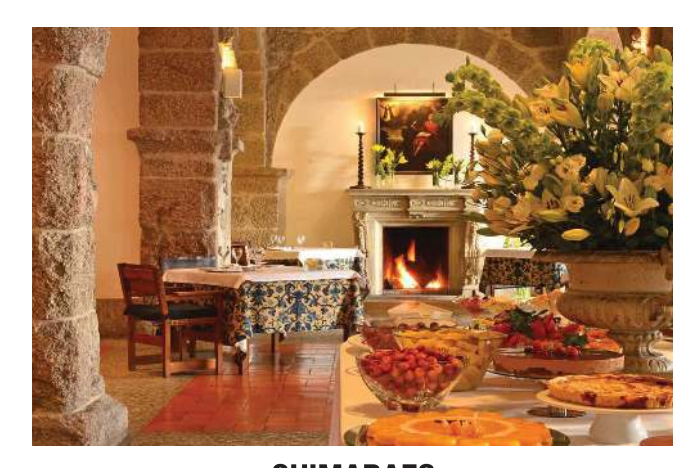
GUIMARAES Tue 30th & Wed 31st Pousada de Guimaraes